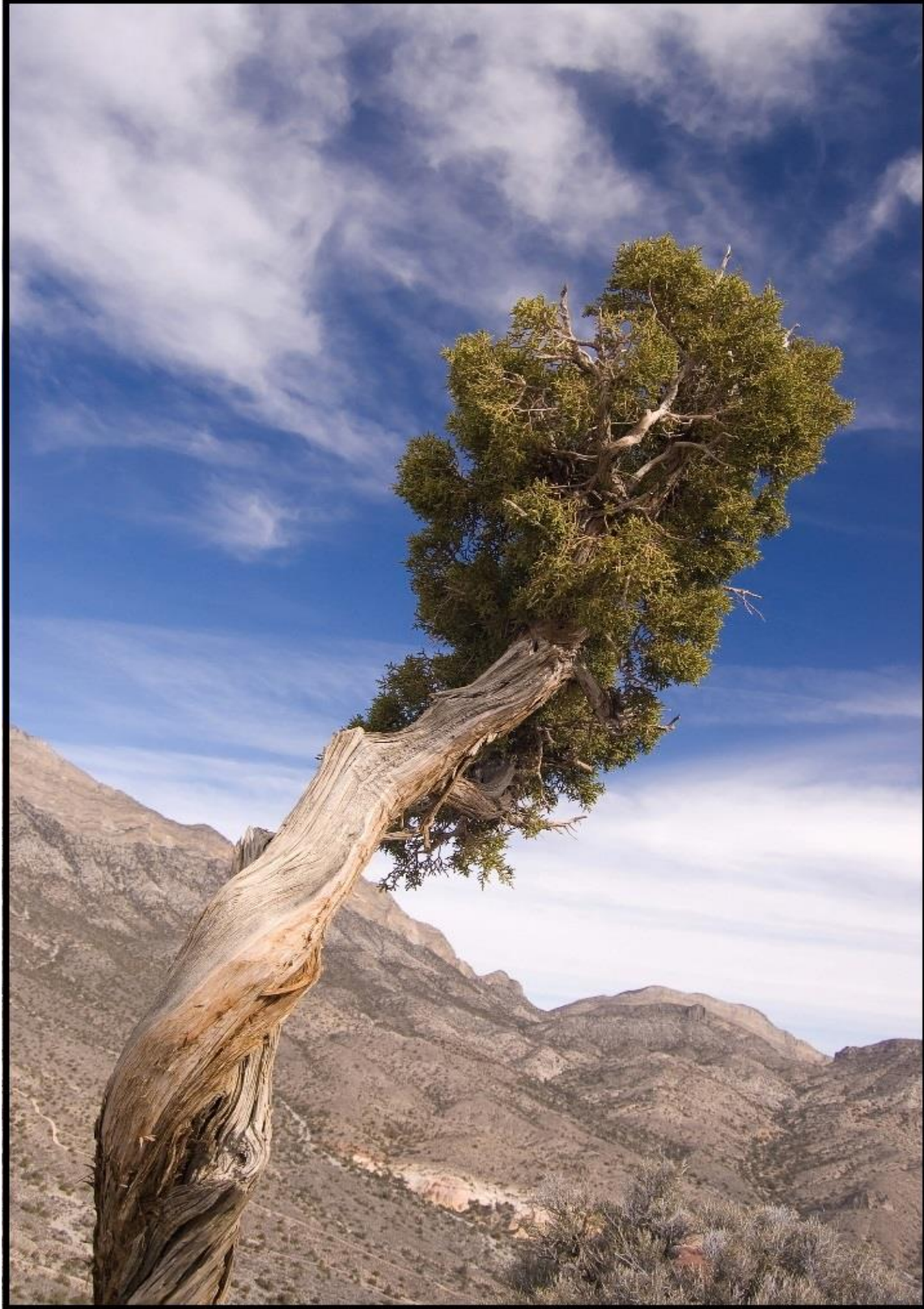
515 Juniper Tree