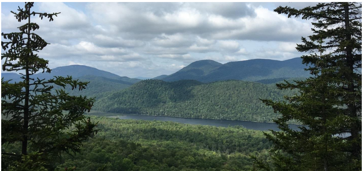
The Beauty of Mount Gilead