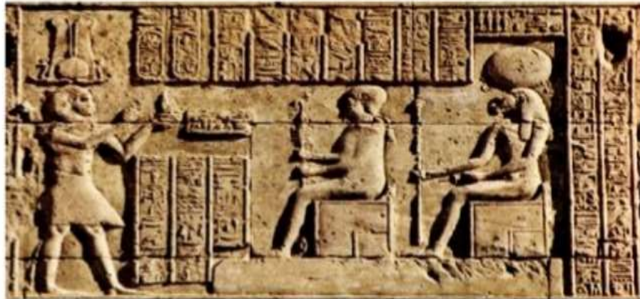
Temple of Denderah.

This engraving represents a pharaoh making offerings to the god Ptah and to the goddess Sekhmet, his wife. Ptah = Primordial Mound