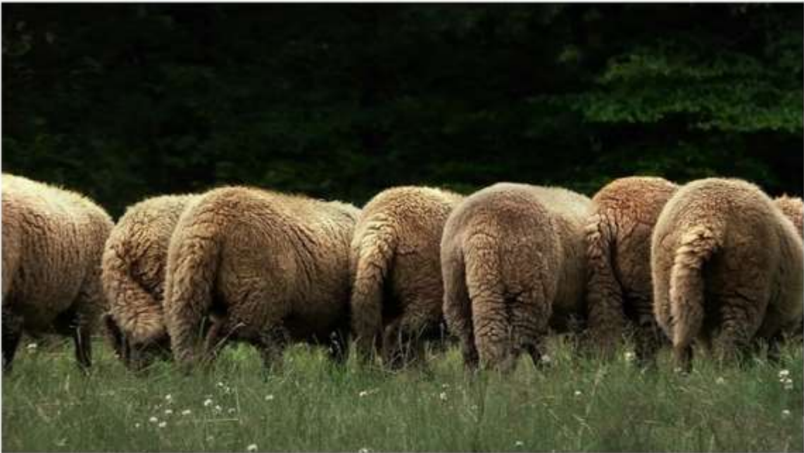
These mature sheep have tails which were never docked

Herodotus, known as The Father of History, 5th century B.C. tells of the little carts used by shepherds to support the tails of their sheep.