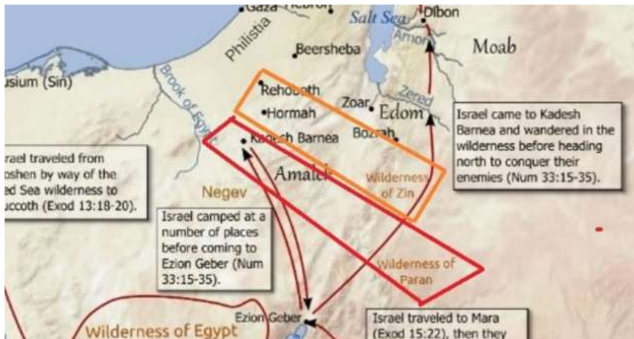
Wilderness of Paran and wilderness of Zin

Kadesh is on the border of the wilderness of Zin and the wilderness of Paran.